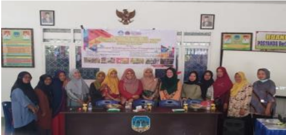
Figure 1: Socialization and training process

on June 16, 2023, at the Tanggetada District office based on Figure 1.