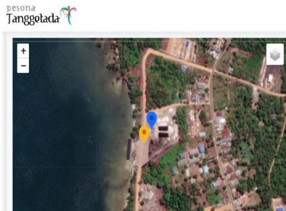
Figure 3. Satellite view of coordinate determination

The introduction of this application is carried out to MSMEs and managers of tourist attractions so that they can be utilized by the surrounding community by adding a list of MSME and Tourism locations so that they are easier to find specifically. Figure 3 shows the results of the creation of UMKM and Tourism location points in GIS conducted during the training.