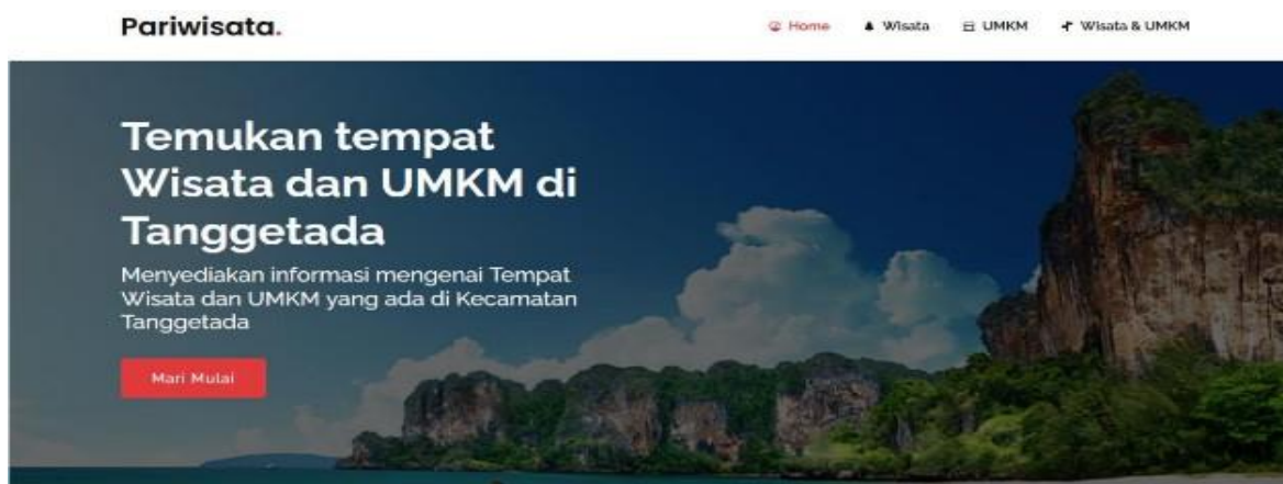
Figure 2. Main Menu of GIS Website

that had been assisted in the implementation of previous community services. In addition, this activity also provides knowledge to MSME actors and managers of tourist attractions that information technology is very important, especially for marketing MSME products and as a promotional medium for tourist attractions. Other training materials include introducing the use of a GIS website that can be utilized by the surrounding community as a promotional medium for the location of MSMEs and tourist attractions that are managed. The main display of the tourism and MSME GIS application can be seen in Figure 2.