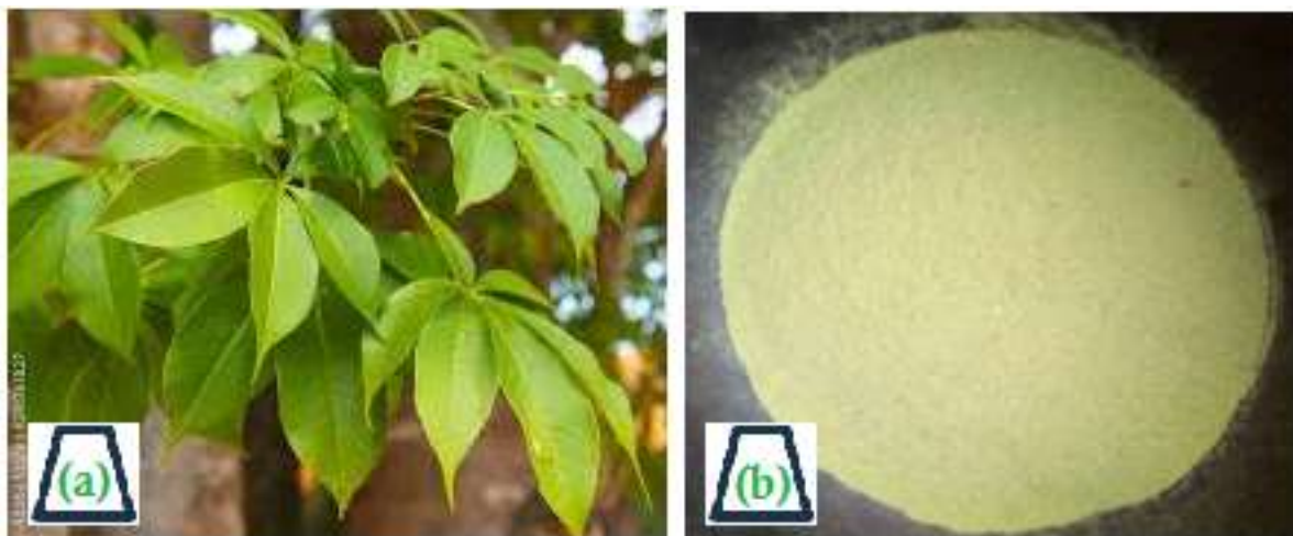
Figure 1. Baobab (a) leaf and (b) powder

Fresh baobab leaves (Figure 1a) were collected at University of Maiduguri, Nigeria, adjacent to the Geography Department. It was washed and kept under ambient room temperature for about 4 days, before crushing and grinding it to powder form, as shown in Figure 1b.