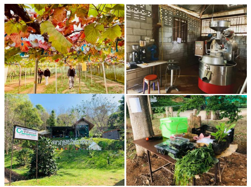
Figure 1 Ukkrit Farm Hill's tourism and agricultural practices for an eco-friendly experience

The integration of eco-friendly tourism at Ukkrit Farm Hill has profound implications for both the farm and the surrounding community. By attracting eco-conscious tourists, the farm generates a significant source of income that supports its agricultural operations and allows for ongoing investment in sustainable practices. This influx of visitors not only boosts the farm's revenue but also raises awareness about the importance of sustainable agriculture and environmental conservation.